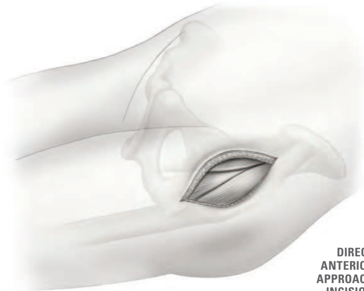
DIRECT ANTERIOR APPROACH INCISION

Direct Anterior Approach hip surgery requires implants and surgical instruments that are compatible with the approach. Specialized surgical tables may facilitate the Direct Anterior Approach by allowing precise positioning of the patient during surgery. Your doctor will consider a wide variety of factors in determining the best course of treatment. Please talk to your doctor and ask whether hip replacement through the Direct Anterior Approach is right for you.